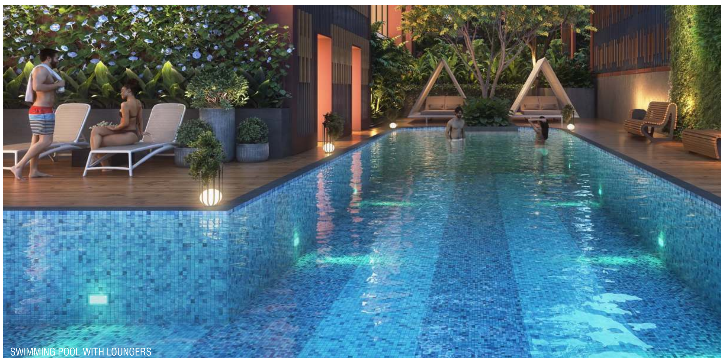
SWIMMING POOL WITH LOUNGERS

SWIMMING POOL WITH LOUNGERS SUPERMARKET DRY CLEANING PHARMACY CAFÉ WITH INDOOR DECK MULTIPURPOSE/ BANQUET HALL LIBRARY/OPEN STUDY TUITION ROOM BOARD ROOMS VR/AR ROOM GOLF SIMULATOR ROOM INDOOR GAMES MANAGEMENT ROOMS BUSINESS CENTRE BILLIARDS KIDS INDOOR PLAY AREA CRECHE THEATRES GYM (MALE/FEMALE) GUEST ROOMS CARD ROOMS TERRACE DINING MULTIPURPOSE SPACE/ YOGA TERRACE LAP POOL